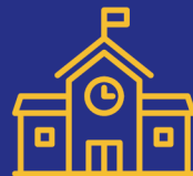
Problems with school