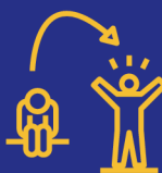
Confidence & self-esteem