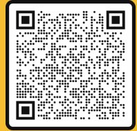
Safe Haven Southampton