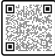
Advice & Wellbeing Hub